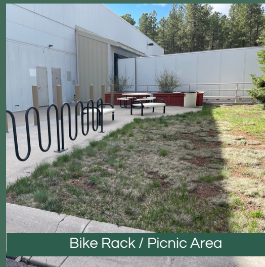
Bike Rack / Picnic Area